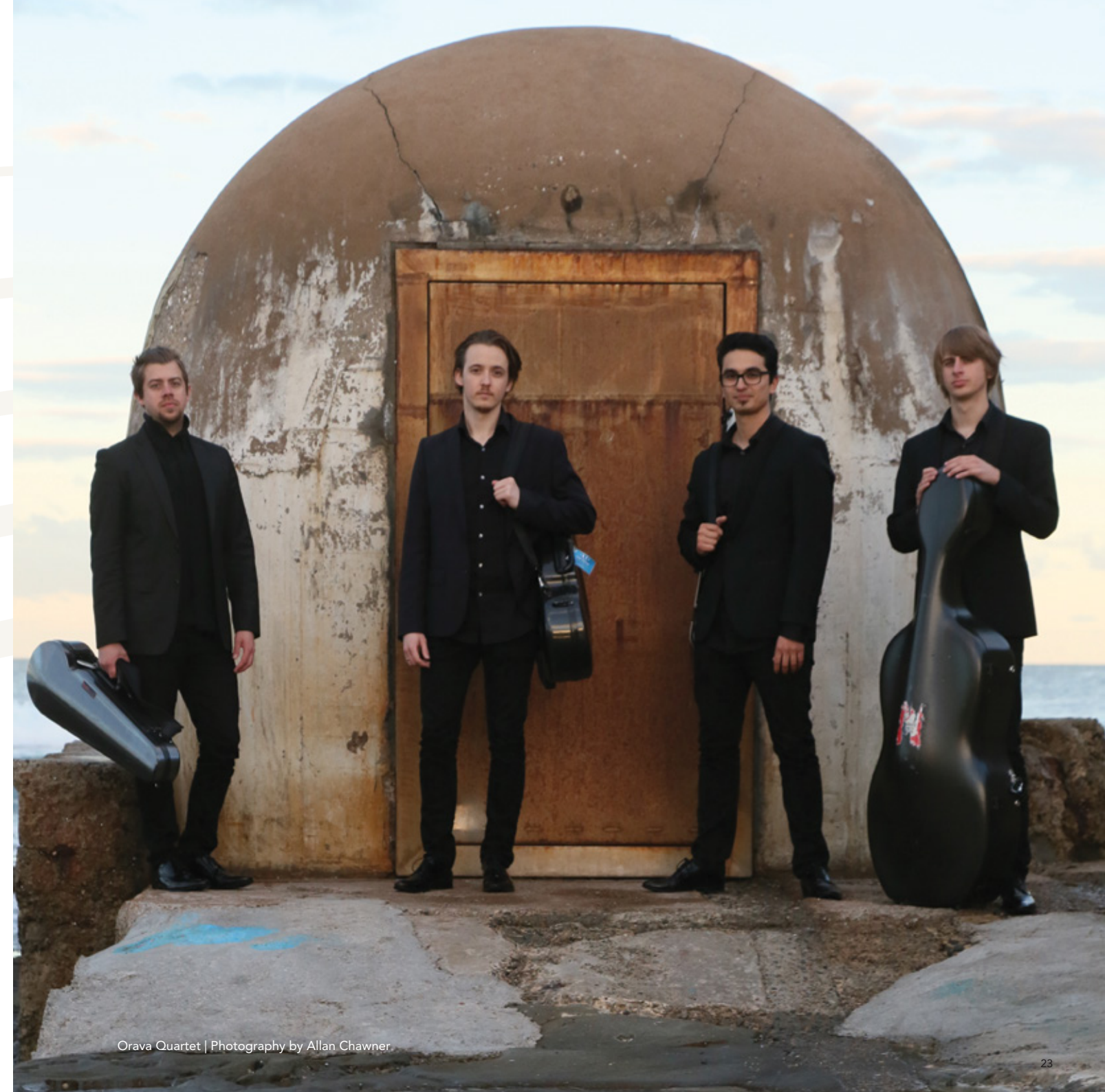
Orava Quartet

If you have an event large or small, contact our office to discuss your requirements.